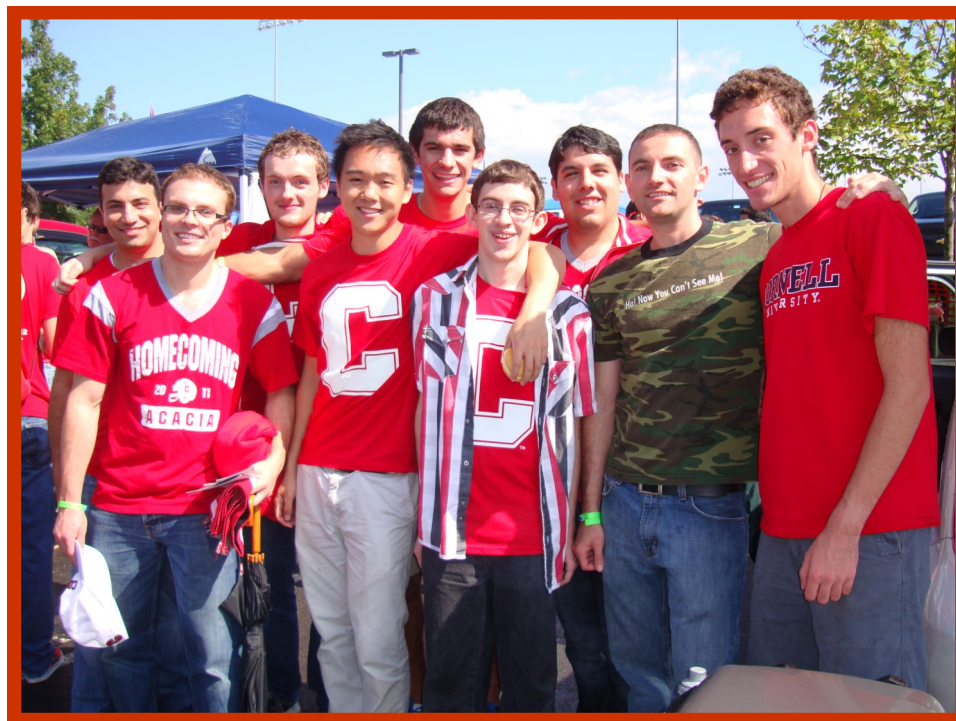
The Homecoming 2012 tailgate