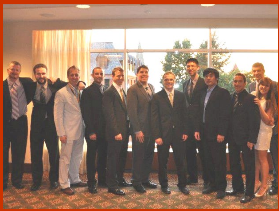
Big Brother—Little Brother “Wineage” Reunion at Centennial+5, August 25, 2012