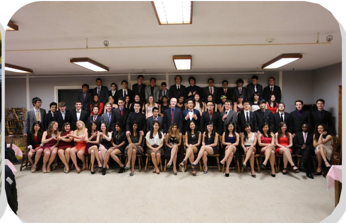
Bottom Right: A group picture of Brothers and their dates during Valentine's Day Formal.